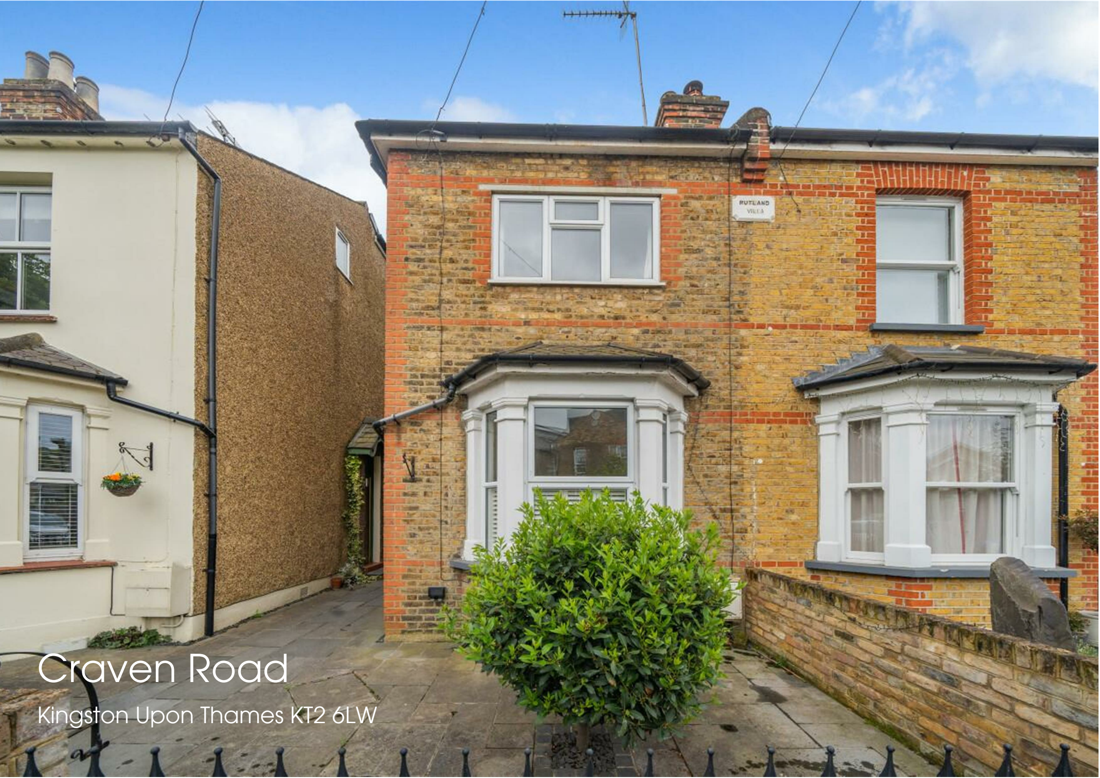
Craven Road Kingston Upon Thames KT2 6LW

34 Richmond Road Kingston upon Thames Surrey KT2 6ED www.gibsonlane.co.uk Tel: 020 8546 5444